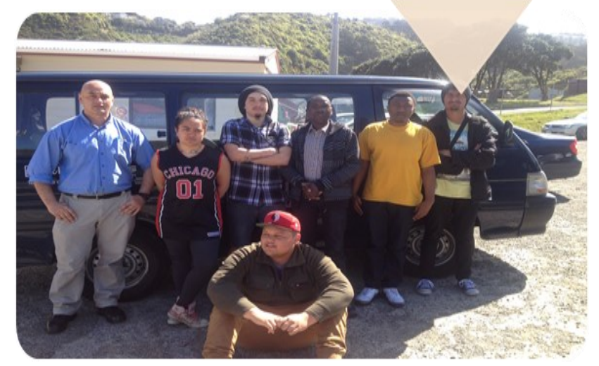
Caption: Day one for six young people at Taylor Preston.

PO Box 43276 Wainuiomata Lower Hutt, Wellington Phone: (04) 972 8766