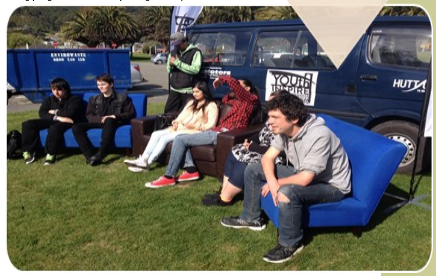
\label{lem:caption: YOUth Inspire young people taking part in a workshop (outside) that helps develop their interview and presentation skills.}