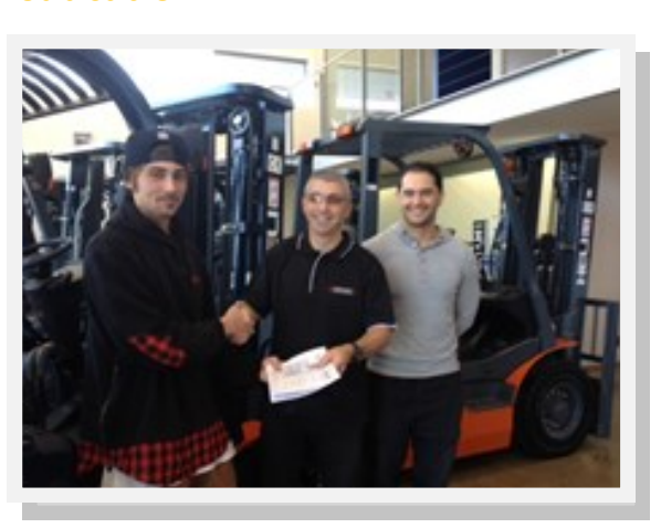
Caption: Here a young person from YOUth Inspire gladly receives his forklift qualification through Central Group Forklifts and Trucks.