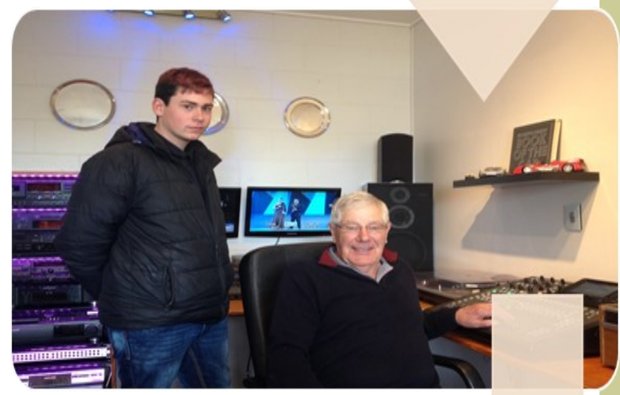
Caption: Here a YOUth Inspire young person meets the person who will be acting as his mentor for the next six months. Part of the YOUth Inspire mentoring programme currently being developed.