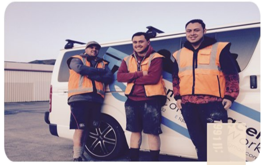
Caption: Two YOUth Inspire young people who were lucky enough to be given employment at TQ Concrete Placers Ltd.