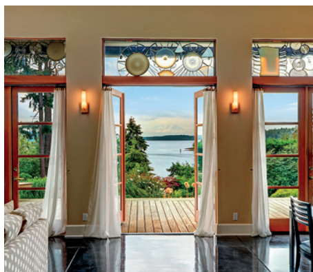
SOLD · LAVENDER LANE listed at $1,148,000