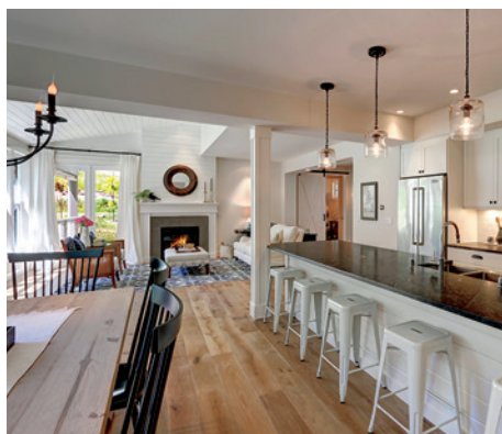
SOLD · SUMMERFIELD LANE listed at $928,000