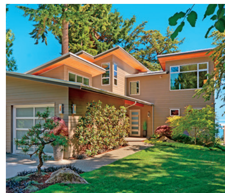
SOLD · MANITOU PARK listed at $1,898,000